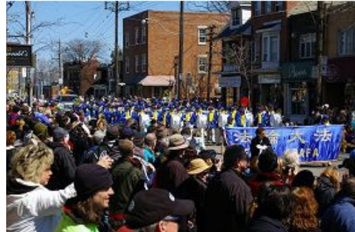
The Toronto Divine Land Marching Band took part in the Easter Day Parade for the second year running

At 2:00 p.m., the parade stepped off at Victoria Park Ave. and Queen St. E. The weather was cold, but brilliant sunshine welcomed tens of thousands of spectators who turned out to take in the parade. The parade featured over 80 entries, including 45 floats and 7 bands. The Toronto Divine Land Marching Band received an enthusiastic response from the spectators.